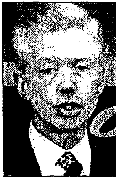
Lt. Gov. Gray Davis Didn't mention Headwaters

"It (the commission) may be to some an obscure state agency, but believe me, we have left our mark," Davis told the foundation,