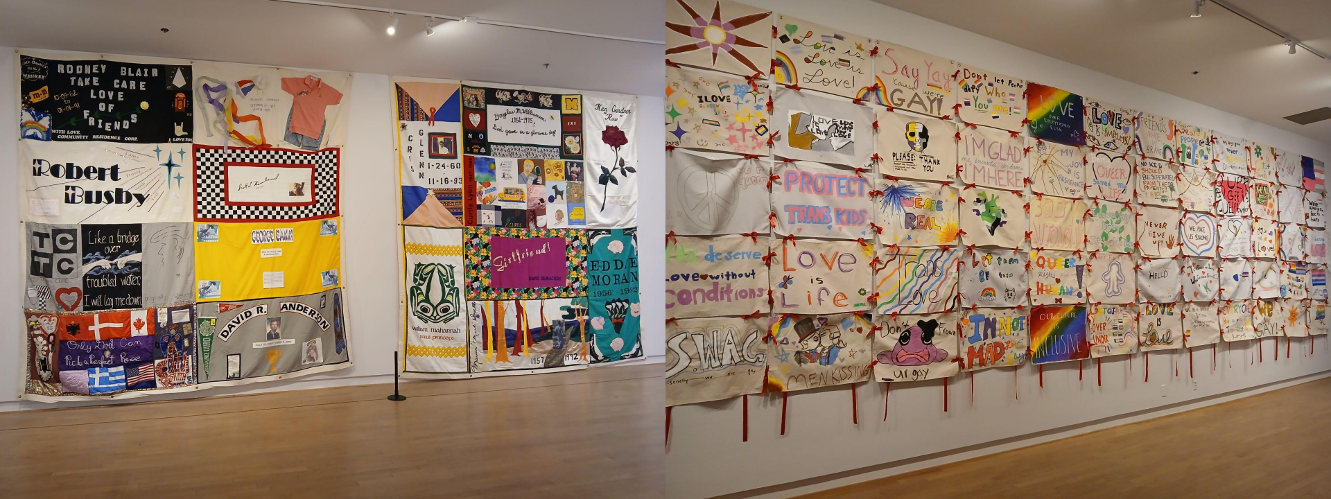
Threads of Love: The AIDS Memorial Quilt On view through June 29, 2025