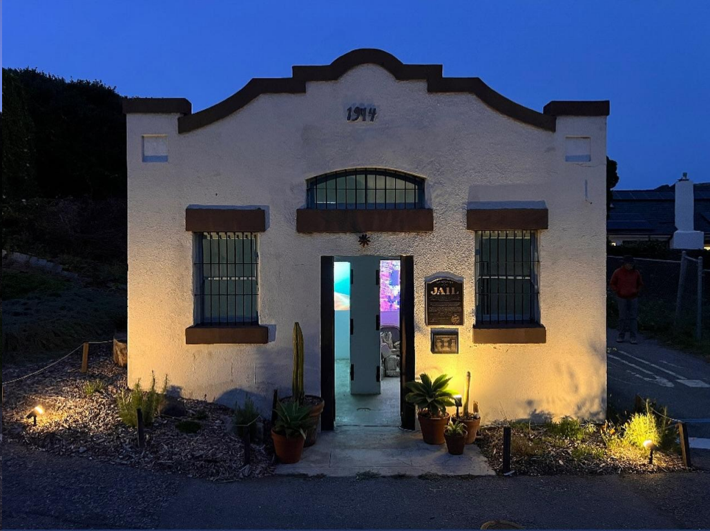
Angela Willets, Fathoming: Among Whales and Walls September 2024 for MAH CommonGround Festival