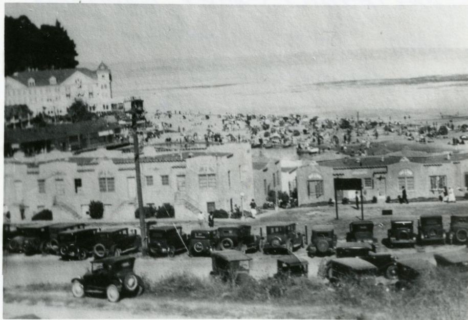
circa 1920.