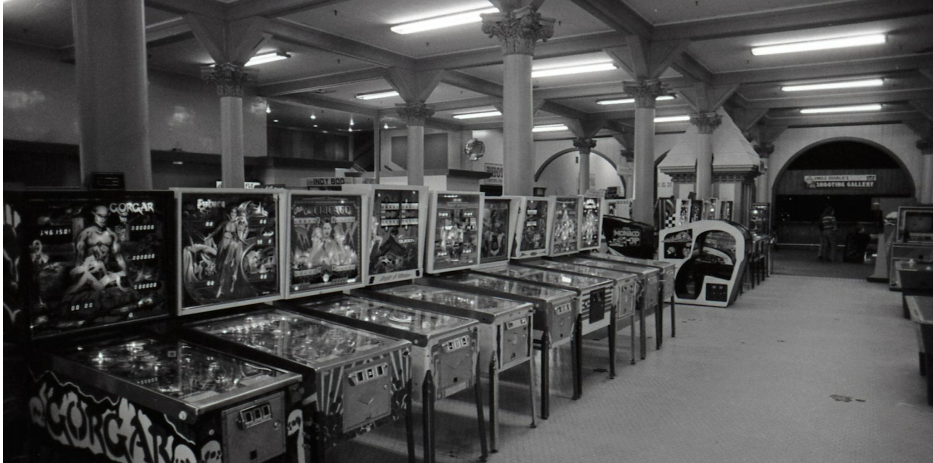
High Score: Vintage Arcade Games from the Santa Cruz Beach Boardwalk October 26-January 24, 2027