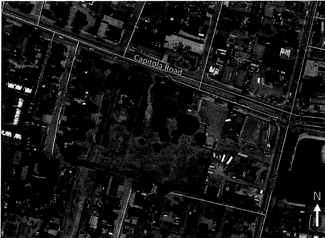
Figure 1. Aerial photograph of the subject property (outlined in red) and immediate vicinity (Google Earth, amended by author)