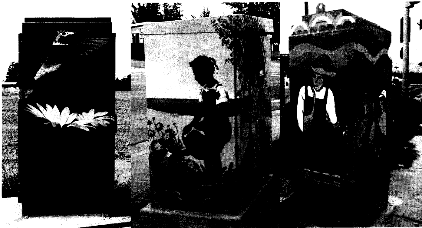
OUTSIDE THE BOX ART PROGRAM

SUMMARY OF IDENTIFIED CAPITAL IMPROVEMENT PROJECTS NEEDED AT BUILD OUT OF THE COUNTY'S GENERAL PLAN